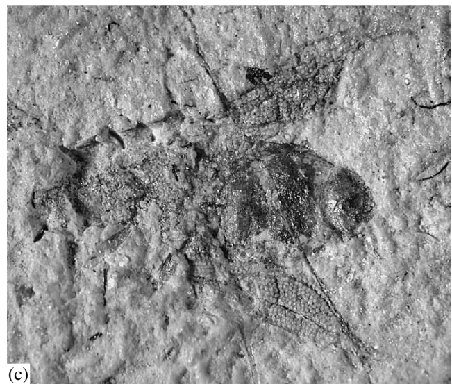
Fig. 2. Early Cretaceous lacebugs: (a, b) Golmonia pater Popov: (a) habitus, holotype PIN, no. 3559/3538; (b) left hemelytron, paratype PIN, no. 3559/3406; (c) Sinaldocader ponomarenkoi sp. nov., habitus, holotype PIN, no. 3064/5661, \times 22 .

homologous to those of modern members of the family (costal, subcostal, discoidal, and sutural one continued apically into membrane); punctation of pronotum (similar to fine areolation of hemelytra); presence of areolate longitudinal carinae on pronotum. Arrangement of raised veins subdividing subcostal and discoidal areas in the genus Sinaldocader is the same as in some extant genera of the tribe Phatnomatini, e.g., Sinalda Distant, 1904 and Etesinalda Froeschner, 1996.